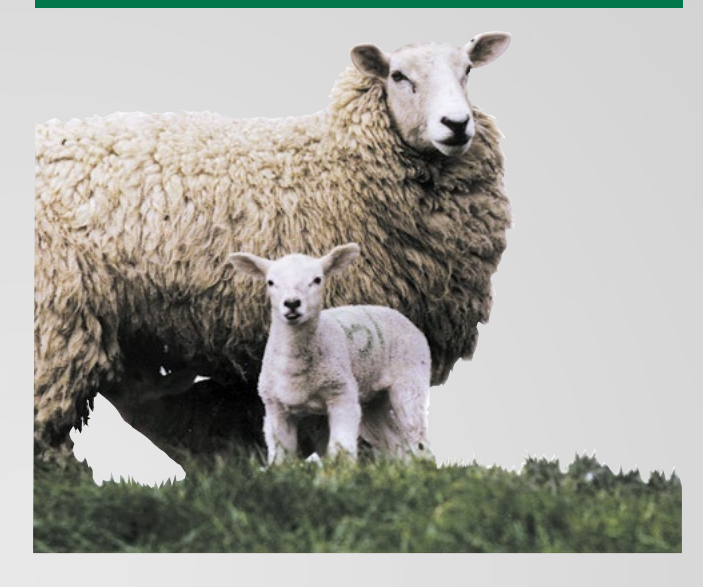
New Sheep Options: Extra energy at key times