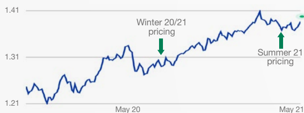
Currency changes in £ v $ over the last 12 months

The molasses market has remained relatively stable over the last few months, meaning that summer prices remain competitive compared to other feed ingredients. While prices have firmed this has been offset by improvements in currency (see graph). We have seen urea prices firm which has impacted our high protein liquid options however, even with this factored in, ED&F Man's high protein products represent excellent value.